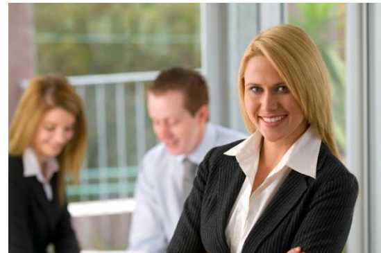
Not acceptable photo